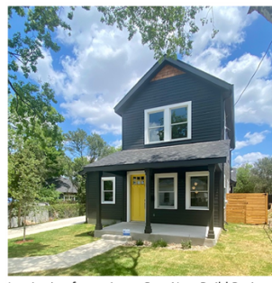
Inspiration for project – Past New Build Project Modern Farmhouse / Urban Infill